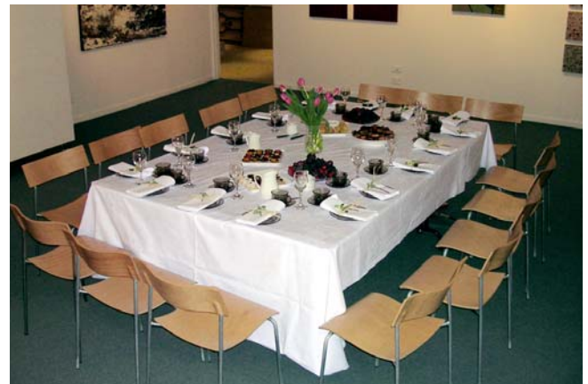
Morning or afternoon tea