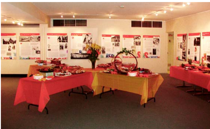
Cocktails/parties up to 100 people