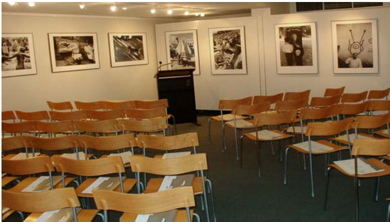
Conferences/meetings up to 60 people