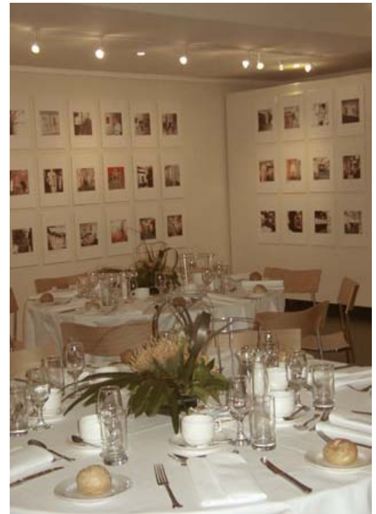
Sit down meals up to 50 people

The Gross Gallery offers your function an intimate and flexible space with a capacity of approximately 100 people. The changing program of exhibitions within the Gallery create an artistic backdrop to your function.