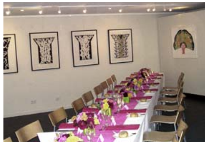
Boardroom meetings up to 50 people

Become a friend of the Jewish Museum of Australia or a Corporate Club Member to receive special rates and other fantastic benefits.